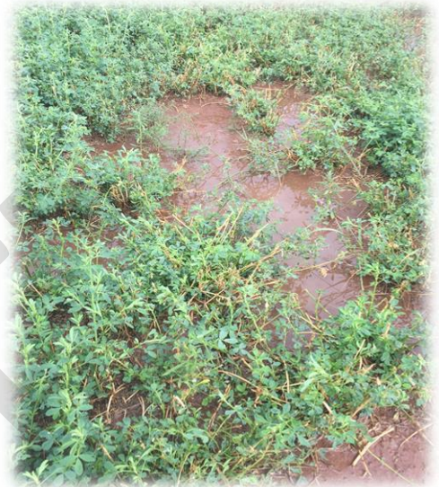
Runoff observed approx. 10 days post-harvest. Approx. slope, 6%.

Field observations were documented on all pivot sites with particular focus on conservation concerns such as runoff and erosion. In seven of the nine pivots assessed very little erosion or runoff was observed in situations of established perennial crops, such as alfalfa on slopes below 5%. Typical application rates for established alfalfa were around 1 inch of water every 72 hours, thereabouts. It should be observed that for this area, during the hot dry portions of the growing season, this closely matches expected evapotranspiration (ET) rates for alfalfa, which are typically around 0.3" per day. Although little runoff was observed in full canopy cover, there was runoff observed on field edges, on bare ground, and on some of the steeper slopes (+5%) directly after cutting when canopy cover was minimized. However, in one instance where the producer reduced application rate post-harvest these effects were mitigated.