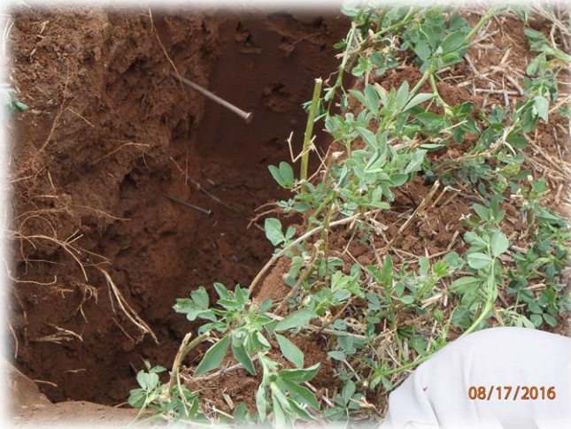
Soil pit dug to classify texture

Soils in the assessment area, overall, tend to be classified as clay-loams or silty-clay-loams. Most are comprised of fine or medium textures and are of mostly eolian deposits. Concerns identified during the assessment associated with local soils include low infiltration rates **2 (typically between .3" and .5" per hour for the soils in question), and fine silt particles that can lead to surface sealing and thus concern for runoff. Surface crusting was observed on most fields assessed, particularly during annual cropping rotations and post-harvest on perennial hay fields.