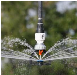
Senninger Super Spray