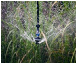
Nelson R3000 Rotator