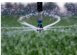
Nelson S3000 Spinner

As part of the assessment process Center Pivot Assessment Sheets were utilized from the Florida NRCS, specifically FL ENG-442F. This assessment sheet looks at pivot design and hardware as well as soils information, system data, and catch can collection data.