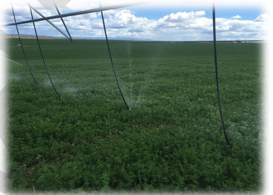
Nozzles dragging on ground

All pivots assessed were designed for between 500 and 850 gallons per minute (gpm) with typical operating pressures of 50-55 psi at the delivery box where flow rates and pressure were measured. Most ranged in size from 7 to 9 towers with average span lengths around 130-140 feet. All but two systems assessed were utilizing end guns between 57 and 116 gpm. None had booster pumps in use. All pivots assessed utilized drops for the nozzles (both flexible and rigid) and were typically around four feet above ground level although nozzle height above ground varied significantly depending on slope and undulations in the field. At times nozzles were observed touching the ground as the center span crested a hill, for example. Other times nozzles were observed 8-10 feet above ground level. This may pose challenges during the design process in anticipating wetted diameter, and can make it difficult in certain situations to achieve a large enough wetted diameters for engineering specifications and design purposes.