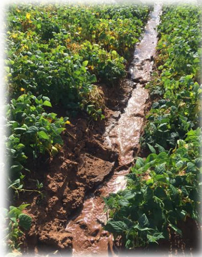
Significant runoff observed on irrigated pinto beans

Where efforts to reduce water in tire tracks failed there were some issues with water running in the tire tracks. In one instance, runoff in the tracks was significant enough to cause erosion in a draw which did leave the field, however in most other cases observed water within the tracks was minimal and did not result in conservation concerns. In annual crop scenarios runoff was observed between rows, where there was insufficient canopy cover to break the velocity of water drops and prevent surface sealing. Although some saturated areas were observed in draws off steeper slopes (greater than 5%), these seemed no more apparent than those observed in sideroll irrigation.